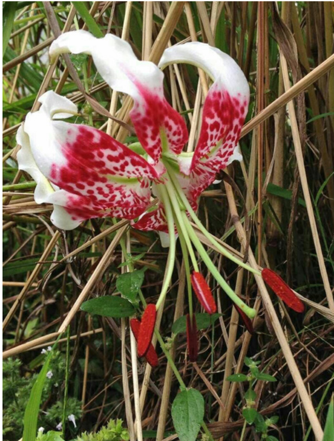
The highly sought after and rarely seen Taiwanese form of Lilium speciosum var. gloriosoides , photographed in its natural habitat in Taiwan in September 2015 by Lin Wei from China.