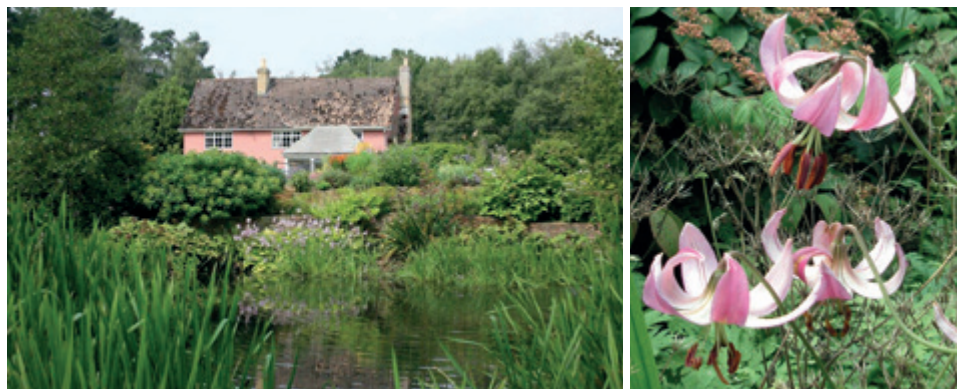
Above, View across the pond and right, Lilium 'Lake Tulare' at Fullers Mill Garden, West Stow, Bury St Edmunds.

Pat Huff recounts a memorable summer's day at Fullers Mill Garden