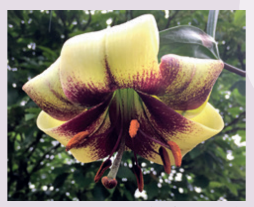
Lilium primulinum var. burmanicum (seed from N Vietnam)

When I was editor of Lilies and Related Plants the subject of the Lily Group using social media was regularly discussed at Lily Group meetings. It was felt that using social media would enable