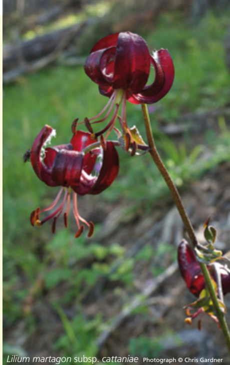
Lilium martagon subsp. cattaniae

30 June Transfer to Thessaloniki for flights.