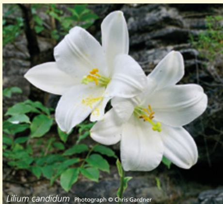
Lilium candidum

For more details contact Chris Gardner via email: info@viranatura.com