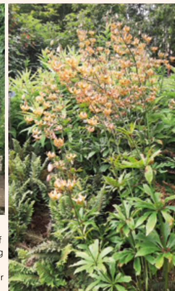
A healthy specimen of Lilium martagon doing very well in the woodland garden near Redwood Grove.

Scott had kindly printed us all a list of the lilies we might find with our map, and as we