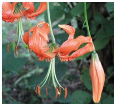
Photograph © Melvyn Herbert

We plan more visits to interesting gardens and much further afield in particular to northern Greece next year. We look forward to the AGM and annual bulb auction and I hope as many members as possible will feel free to join in.